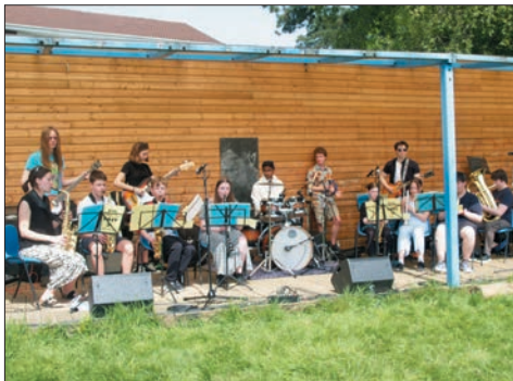
RCS Big Band