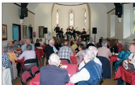
A packed Old Church Rooms for the Festival Jazz night featuring Cube.