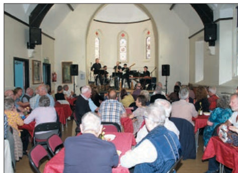
Some of the Audience