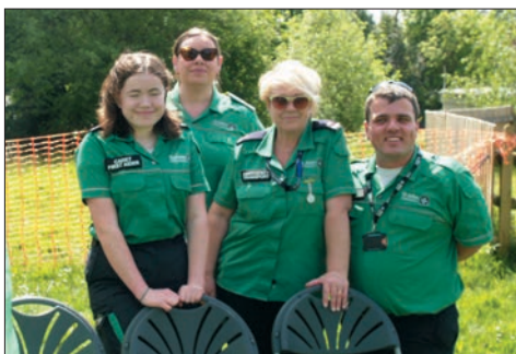
St. John's Ambulance Team