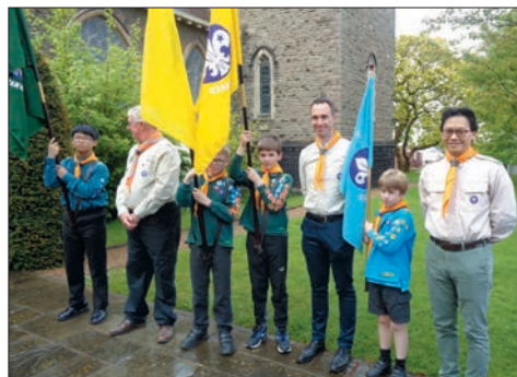
Scouts Guard of Honour