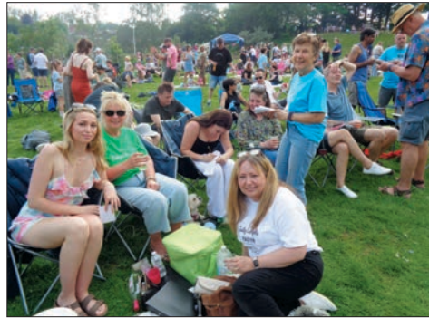
Crowd at the Party in the Parc