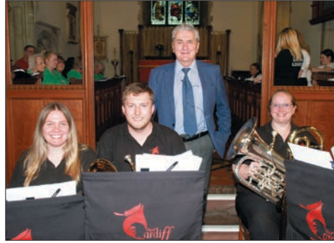
Band with their Leader