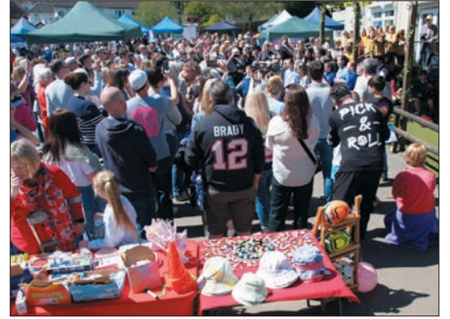
Some of the Crowd at the Fete