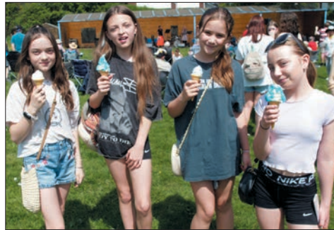
Ice Cream Girls