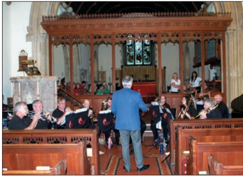
Mellingriffith Band at Alzheimers Concert