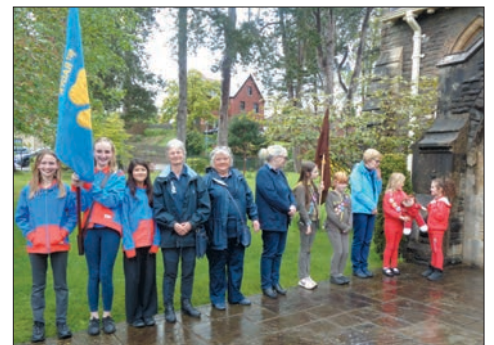
Guides Guard of Honour