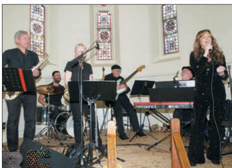
Jazz Night Singers