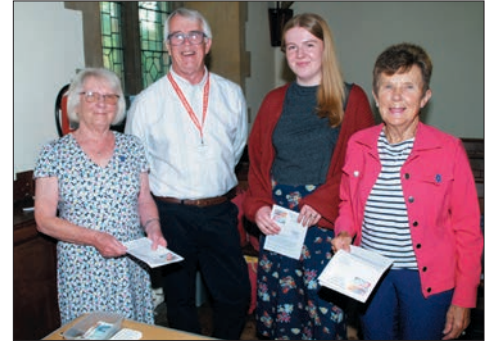
Members of R&M Friends of Alzheimers