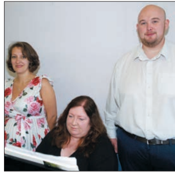
Welsh College Singers