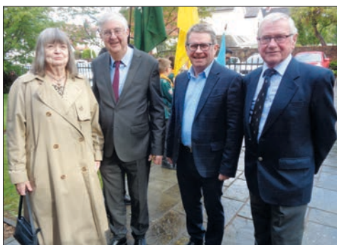
Guests at the Church Service