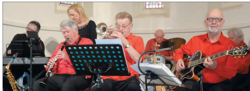
The Band playing at the 50th Celebrations