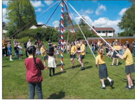
Maypole Dancers - Radyr Primary