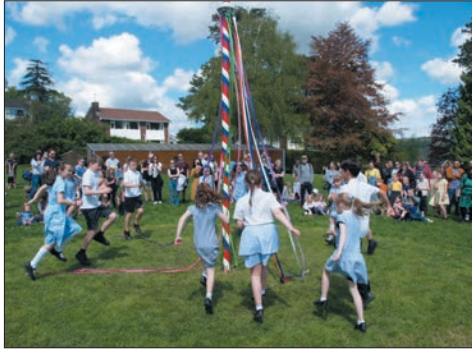
Maypole Dancers - Bryn Deri