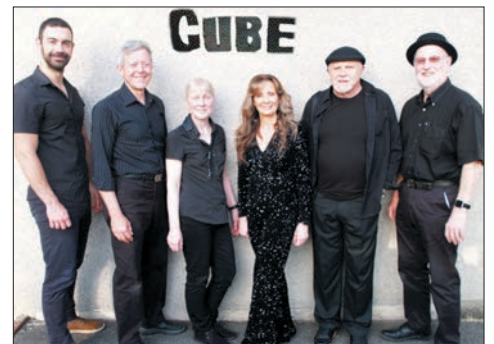
Cube Jazz Band