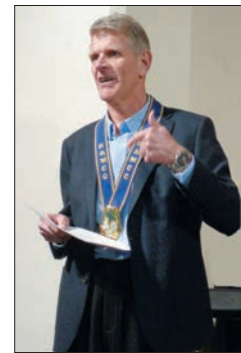
Cutting the Cake