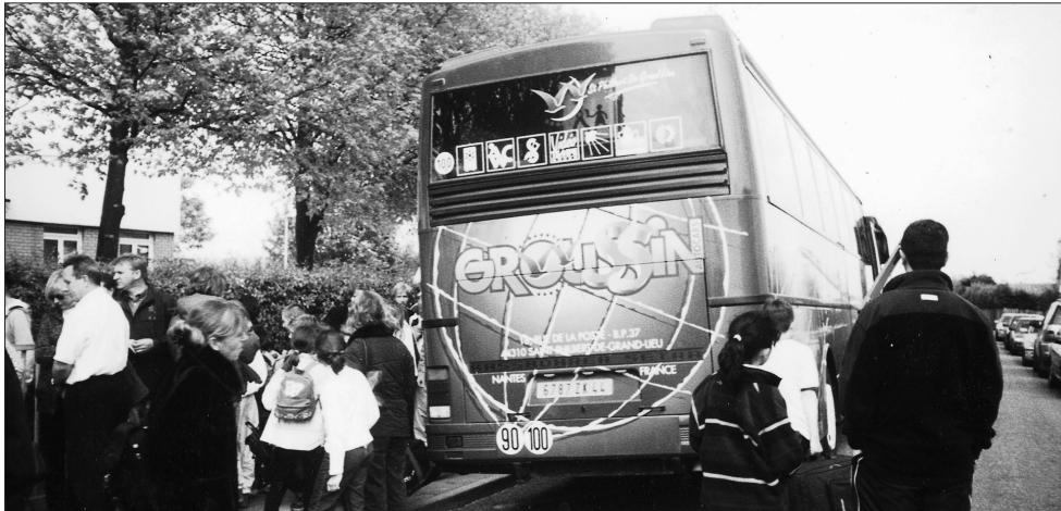
The Grossin Coach prepares to return to St. Philbert. A site we will no longer see in R&M.