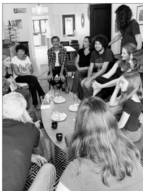
Three generations, 2023

We travelled to Caen the day before the main D Day celebrations, alongside veterans, enthusiasts, and an array of WW2 vehicles. Our "send off" from Portsmouth was spectacular, since we were "escorted" by several boats and a helicopter. They were present, of