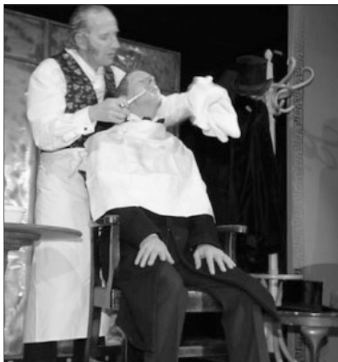
Sweeney Todd – 2010

He was a man who lit up the stage, had a twinkle in his eye and vast experience. He was always the first to know his lines and had the ability to make the audience believe he was actually going through whatever the character was going through. He also knew how to listen and focus on whomever he was acting with, and he knew how to use his voice and body to serve whatever role he was playing.