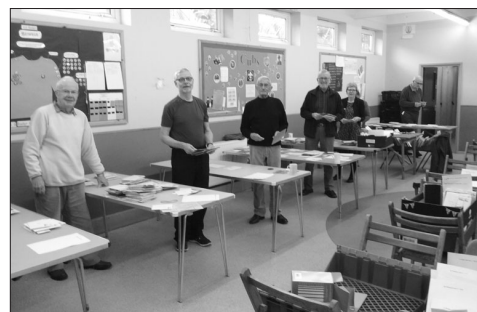
December 2019, the last time that the scout post scheme was operating.

The Cardiff and Vale Scout Executive have announced that the Scout Post Scheme that operated in Cardiff and the surrounding area has ceased. Scout Post has existed for more than 35 years selling stamps and delivering Christmas greetings through local scout groups in the Cardiff and Vale area.