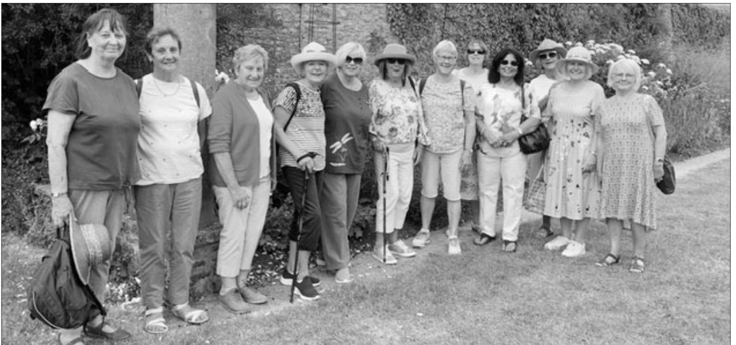
"Members at Duffryn Gardens"

Don't forget that as well as being able to borrow books, both adult and children, they carry recycling and food waste bags.