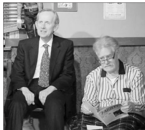
The Sunshine Boys – 2015

And for the very little span All thespians are borne in mind Seek not to question other than The roles I leave behind