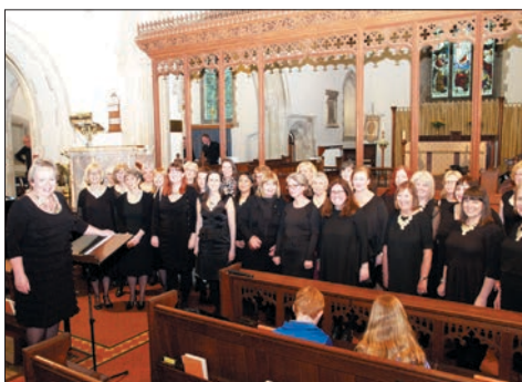
Ladies of Cor Caerdydd