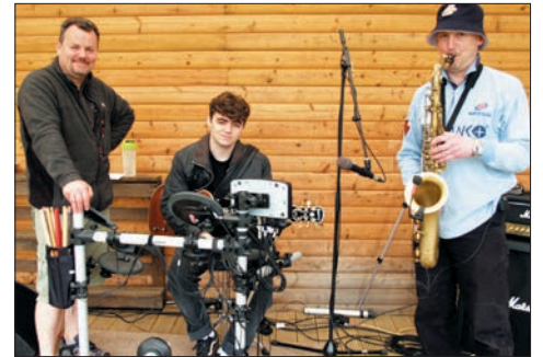
Band warming up