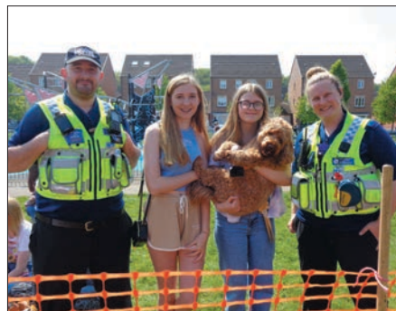
Local bobbies and poodle