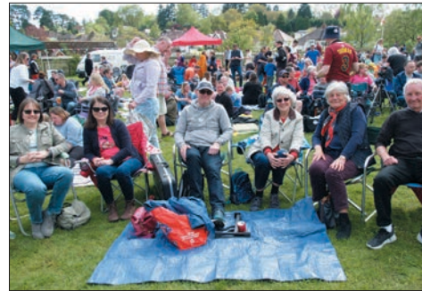
A group at the Party in the Parc