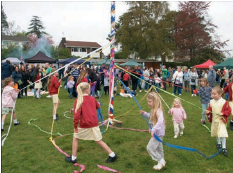
Radyr Primary Maypole dancing