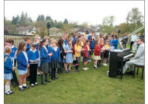
Joint Schools Choir