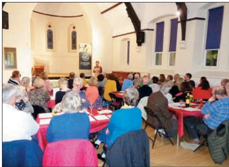
Wine and Cheese night