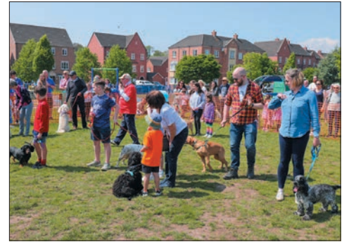
Dogs in competition