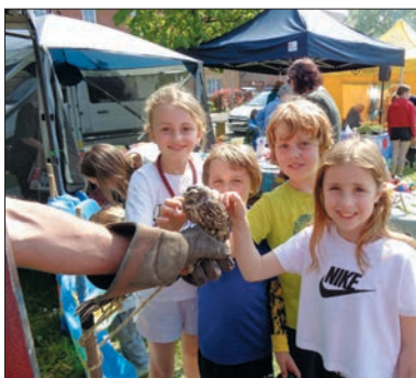
Stroking the baby owl