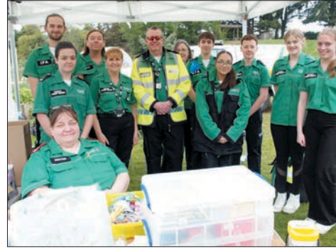
St. John Ambulance stall