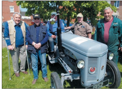
Tractors on show