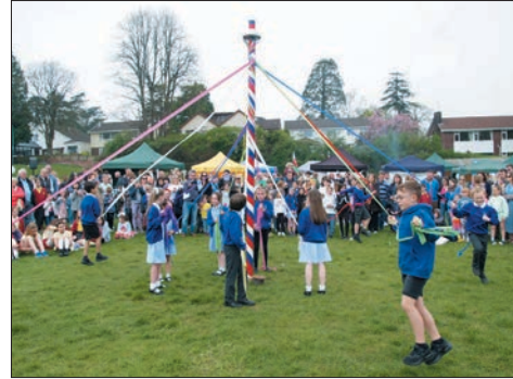
Bryn Deri Maypole dancing