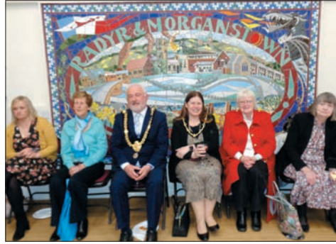
Lord Mayor of Cardiff in OCR