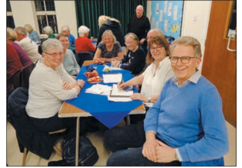
Festival Quiz winners