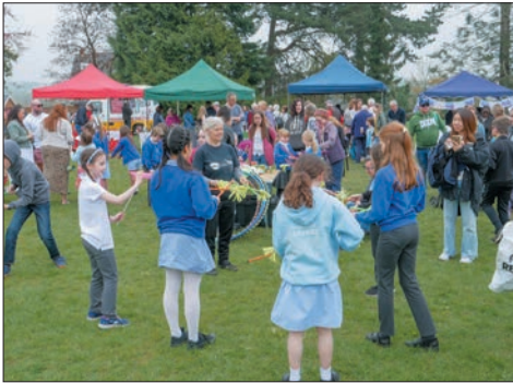
A large crowd assemble at the Fete