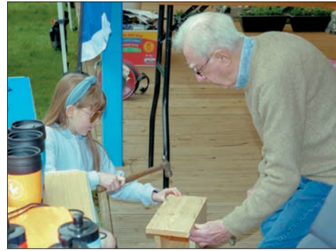
Bird box making