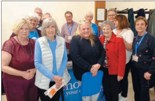
Tenovus team at the quiz