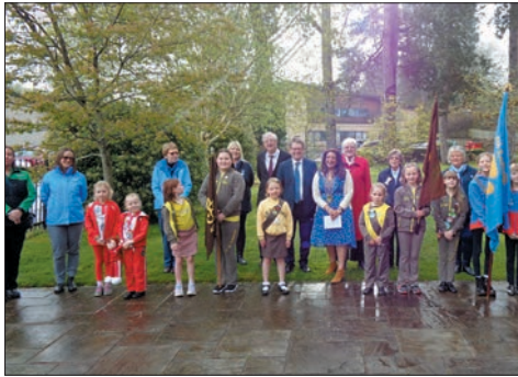
Guides/Brownies Civic Service