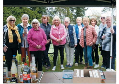
R&M and Treforgan WI