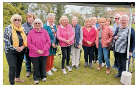
Members of Radyr and Morganstown WI and Treforgan WI at the Festival Fete.

We meet on the second Monday of each month at 7.30 in the Old Church Rooms, Park Road, Radyr,