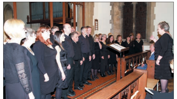
Cor Caerdydd in full voice