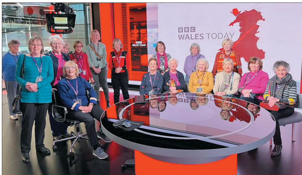
Radyr and Morganstown WI on a trip to the new BBC studios in Cardiff

The Gardening Group met for a meeting at Morganstown Village