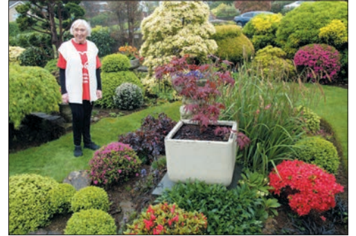
Gill at the Open Gardens