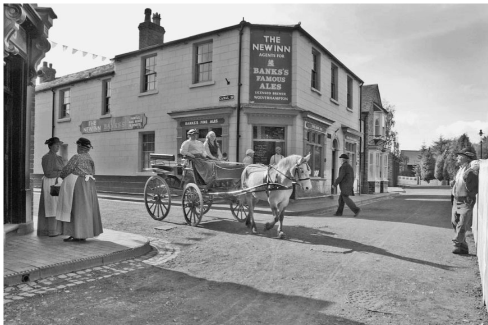
Blists Hill Victorian Town

The Coalport China Works is situated in the original building with the original kiln to fire the china and includes a fascinating collection of Coalport China. Blists Hill is a working Victorian town with a pub, a chip shop and a Victorian pharmacy. You can buy a pint of beer for three old pence and change your 21st century currency