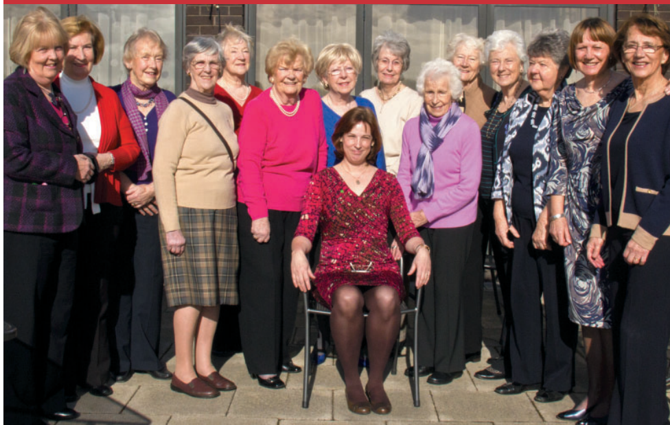
The NSPCC Committee at the Charity Lunch