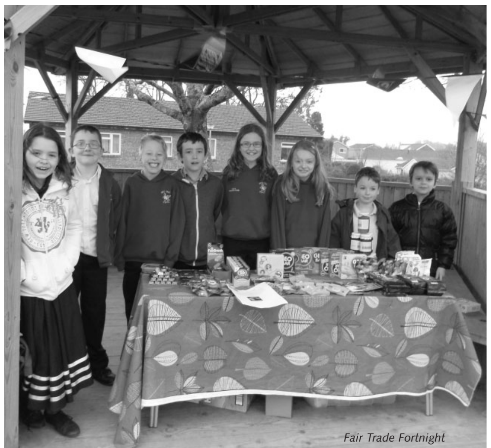
Fair Trade Fortnight