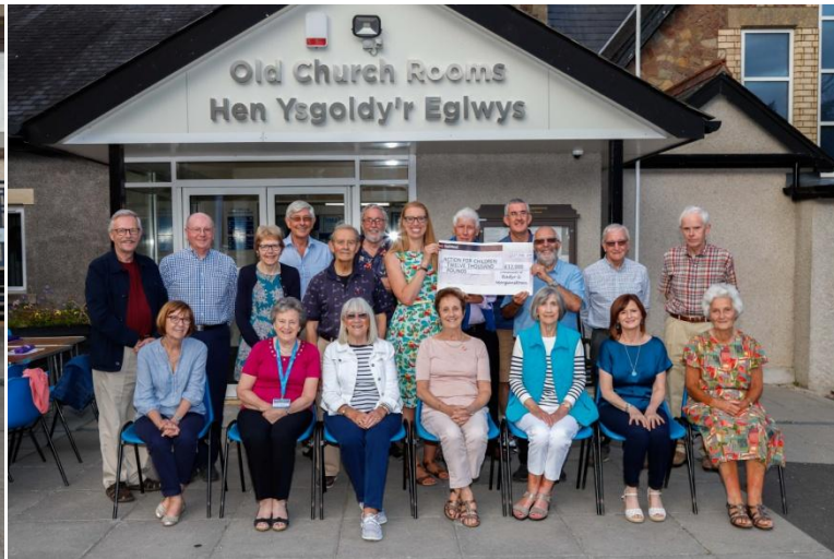
2019 Festival Committee