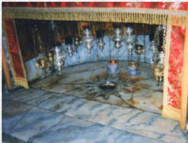
Reputed birthplace of Christ within the Church of the Holy Nativity, Bethlehem

We gather at London Heathrow for our afternoon flight to Tel Aviv. on arrival we will be met by our guide and driver and then driven up to Jerusalem and our hotel within the Old Walled City. Overnight stay in Jerusalem.