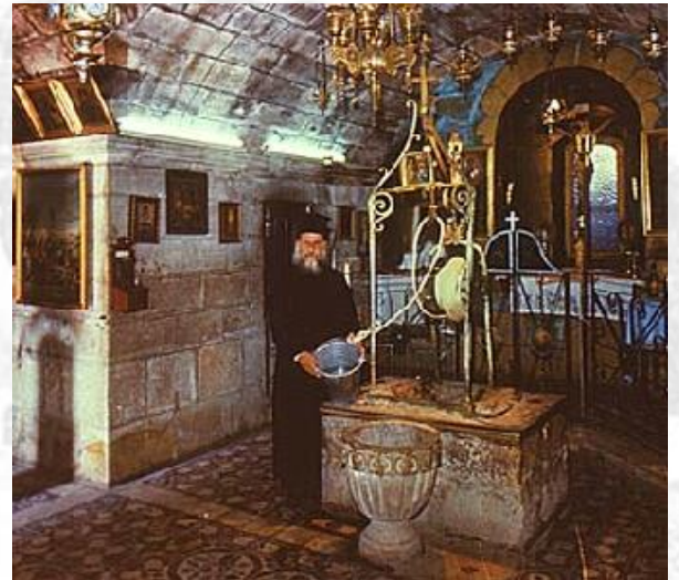
Jacob's Well, Nablus

After an early breakfast we drive to the Israel Museum and the Shrine of the Book to see the Dead Sea Scrolls then drive on to the town of Abu Ghosh, one of the possible sites of Emmaus where we remember the beautiful story of the resurrection appearance of Jesus to his disciples. Leaving Emmaus we head north towards Galilee through the heart of the West Bank, noting as we drive some of the 'facts on the ground' about the Occupation, as we come to the city of Nablus. Here we will visit Jacob's Well, where the Fourth Gospel tells us of Jesus' encounter with the woman drawing water. We then proceed around the Sea of Galilee to our hotel situated on the shores of the lake which will be our home for the final four nights of our pilgrimage. Dinner and overnight stay by the Sea of Galilee.