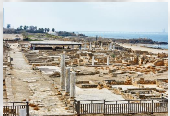
The excavations at Caesarea Maritima

We leave Galilee after an early breakfast to drive south and along the coast to Caesarea Maritima to visit this beautiful Roman and Crusader port city. View the ancient harbour, fortifications, twin aqueducts and theatre. Paul was imprisoned here for almost two years before his trial in Rome. For Christians it is a place of great significance as it was here that Peter baptised the first Gentile, Cornelius the Roman Centurion. We break for lunch at the historic port before heading to Tel Aviv's Ben Gurion Airport and our return flight to London.