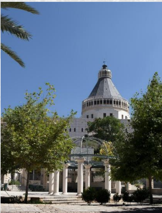
The Basilica of the Annunciation

We leave Tiberias after an early breakfast and drive to Nazareth where we will join members of the local Anglican community for Sunday worship at Christ Church. We then continue to central Nazareth to visit the Basilica of the Annunciation and the Greek Church built over the ancient well. We then visit the village of Cana and the Franciscan church built on the site of the house associated with the first miracle. We then drive across the plains of Armageddon to Mount Tabor, the traditional site associated with the transfiguration of Jesus before Peter, James and John. Local taxis take us to the summit. After lunch we drive across to the Jordan Valley to visit the extensive excavations of Beit Shean. The city was a member of the Decapolis and the most important Roman commercial and military centre west of the Jordan at the time of Jesus. John the Baptist may well have preached there and it was on the walls of this city that the Philistines hung the dead body of Saul after his defeat on Mount Gilboa. Return to Tiberias in good time for dinner and overnight stay.