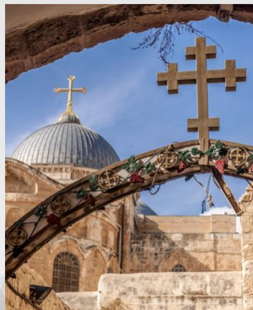
Church of the Holy Sepulchre

We begin after an early breakfast and drive to the Dung Gate to view the Western Wall, Judaism's holiest site and if permitted we will ascend the Temple Mount to view the Dome of the Mosque. We will exit the Temple Mount and continue to the beautiful Crusader church of St Anne built above the twin pools of Bethesda where Jesus cured the sick man. The church was built in 1142 by Avda the widow of Baldwin, the first king of Jerusalem is believed to be on the place where the house of Joachim and Anne, Mary's parents, once stood and is the most beautiful church in the city. We will then break for lunch. In the afternoon we will begin our walk along the Via Dolorosa from the Chapel of Condemnation to the Church of the Holy Sepulchre. Along the way we visit the Convent of the Sisters of Zion built on the foundations of the Roman garrison to see the pavement that is venerated as the place where Jesus stood before Pilate. We will bring our day to a close at the Church of the Holy Sepulchre. Dinner and overnight stay in Jerusalem.