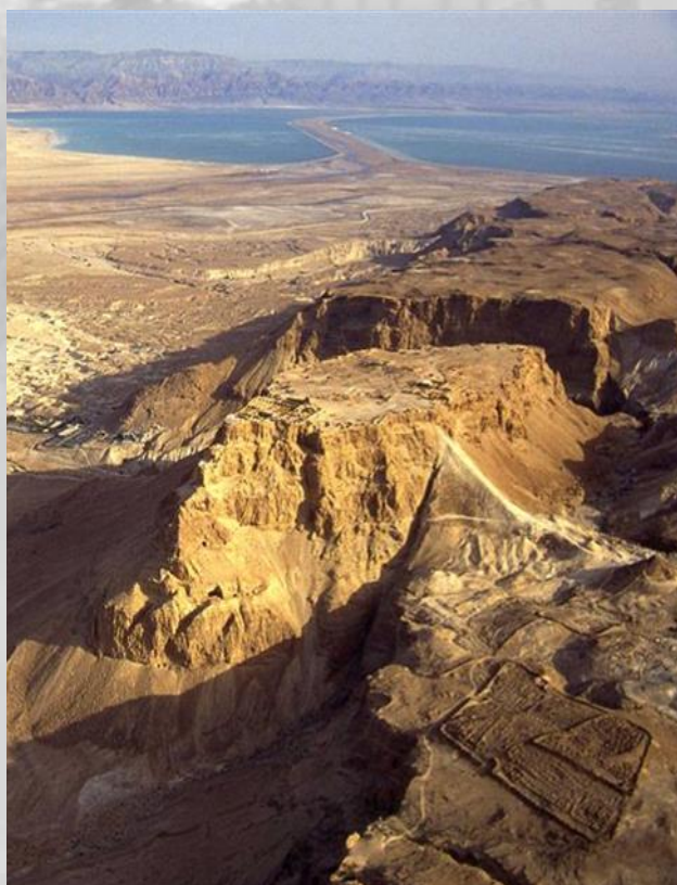
The Mountain-top fortress of Masada