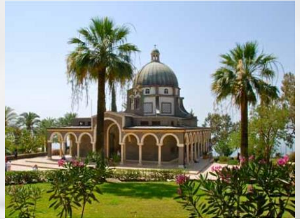
The Mount of Beatitudes

This morning we follow the ministry of Jesus along the shores of the Sea of Galilee and in the hills overlooking the Lake. After a Eucharist at the lakeside chapel at Peniel we continue to Tabgha to the Church of the Loaves and Fishes that commemorates the feeding of the 5,000. At Capernaum the centre of Jesus Galilean ministry we visit the first century house identified as the home of Peter where Jesus would have stayed then drive into the hills to the Mount of Beatitudes that overlooks virtually all the places where Jesus lived and worked. After lunch at Kibbutz En Gev we sail on the Sea of Galilee and return to our hotel. On route we will visit the "Jesus boat" a 1st century boat recovered from the lake. The rest of the afternoon will be free to relax. Dinner and overnight stay by the Sea of Galilee.