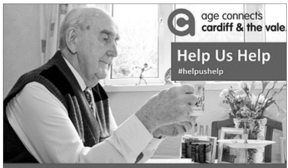
Our limited resources are now focused on maintaining telephone contact with the hundreds of older people on our database identified as most vulnerable to offer support with shopping and keeping in touch. If you or an organisation you work for want to show support for our ongoing charity work at this time, then please make a donation and help us reach out to as many as possible in need during this unsettling time to make sure they stay safe and well.

Since the start of the Coronavirus lockdown, Age Connects Cardiff & the Vale has taken over 3,600 calls for information, advice and reassurance and many clients are called weekly to maintain social contact. The charity has also