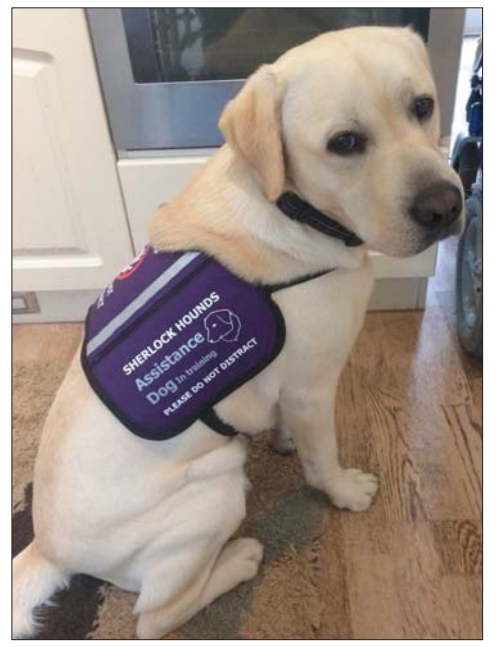
Unfortunately even with his jacket on some people just ignore this and touch him without my consent and distract him from his work and

Thanks again to the club's main sponsors: Cicchetti who will be the shirt sponsor for the third year and to Pugh's Nursery and Rees Wood Terry who are always supportive. Thanks also to the other sponsors throughout the village.