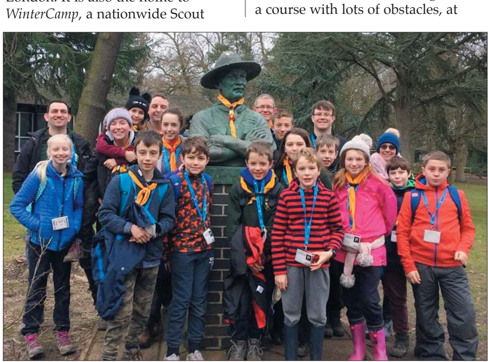
Investiture in front of the bust of Baden-Powell

My favourite activity was the quad bikes which involved driving around a course with lots of obstacles, at