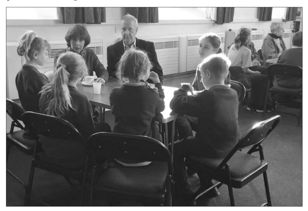
www.radyr.org.uk is...a photo-archive for our local community

The children love hearing the fascinating stories from the older generation, so please come along to talk to us - we are all ears.