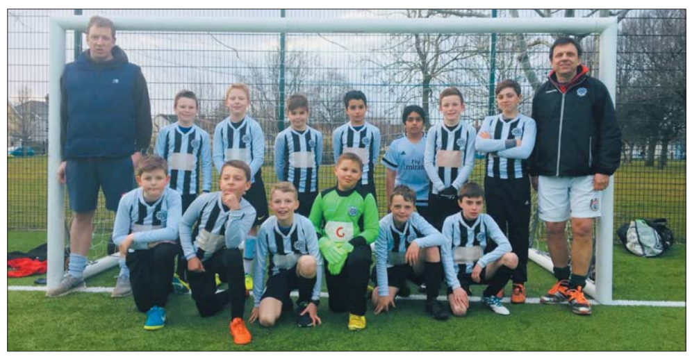
Radyr Rangers Under 11's

coaches from the under 11's (team photo below)! There is no payment made to those involved in arranging and attending these fantastic festivals, all are volunteers. Similarly, those involved in coaching and running the teams all year round are volunteering their time and energy to ensure the success of the team. The reward is seeing the children's happy tired faces, team spirit and developing friendships. After many years of loyal and