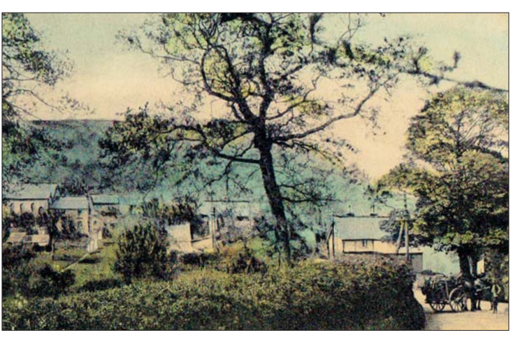
The road from Radyr to Morganstown c 1900

This village would have merited the name Pentrepoeth (the Hot Village)