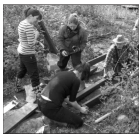
Cardiff Conservation Volunteers constructing the new Boardwalk –completed June 11