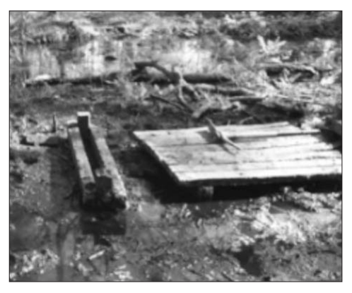
The state of the old boardwalk supports