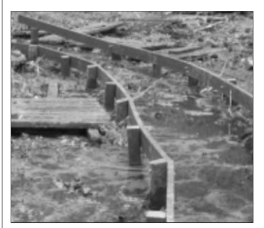
The new plastic 'wood' should last longer than the original oak in this environment