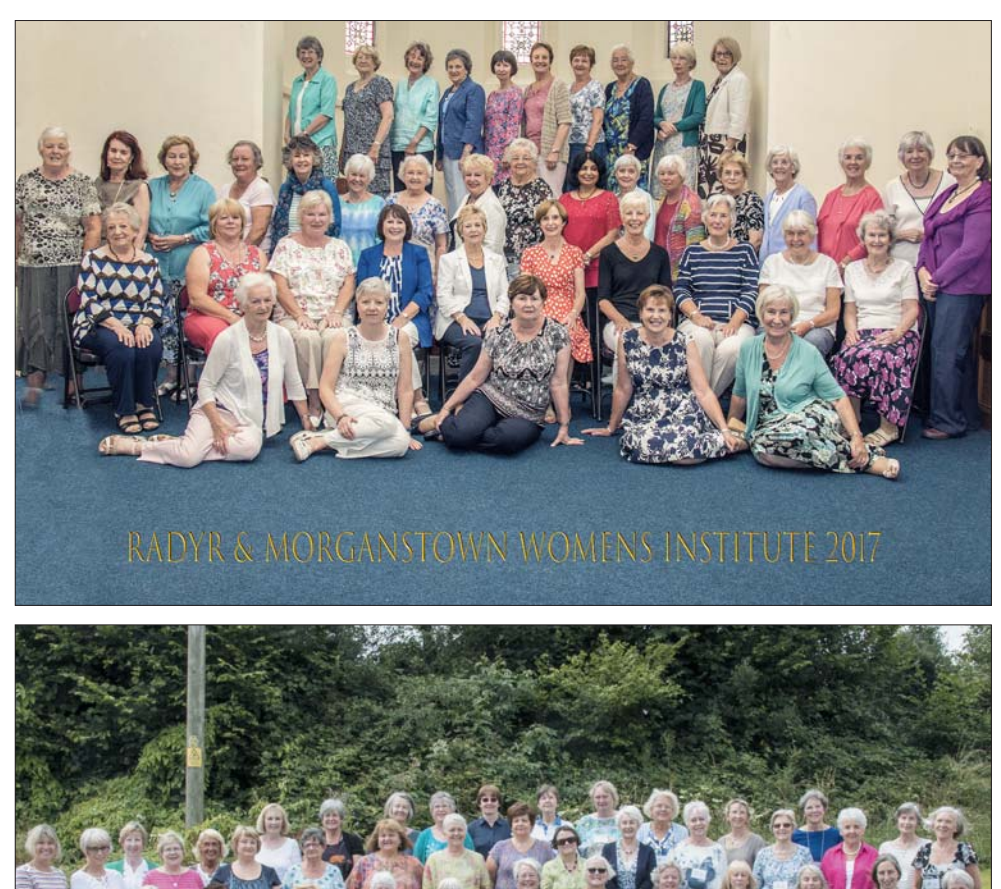
Photo-call for the Women's Institute groups in Radyr and Morganstown