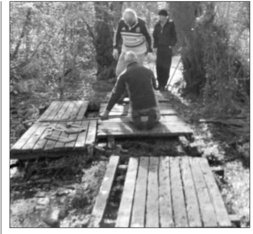
Radyr Woods Wardens dismantling the old boardwalk

"Radyr Woods lie between Woodfield Avenue and the Comprehensive School to the west and and Fisher Hill Way and the new houses to the east. It is accessed via gates in Taff Terrace, Woodfield avenue, Fisher Hill Way, Junction Terrace and the public footpath from Danescourt."