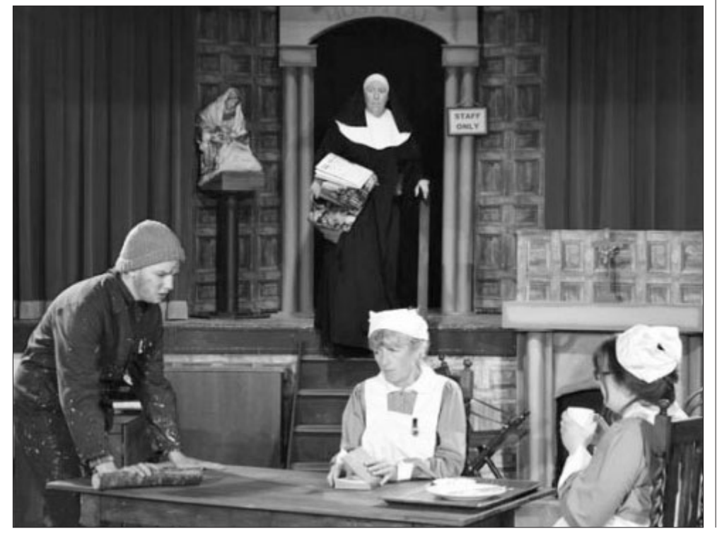
Photo below show a scene from the recent production of 'Bonaventure'

So, if you would be interested in joining the society – to show off your on-stage talent, or to be involved in an enjoyable, creative and rewarding drama-based activity – please contact the Society via its website www.radyr.org.uk/drama, by email to rds@radyr.org.uk or contact Ian Ogden on 07711-713176. It is hoped at least some of you will decide to dip your toe in the amateur theatre water!