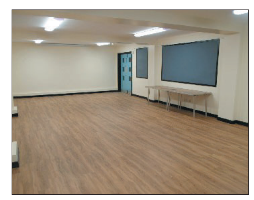
Weir Room 40ft x 17ft