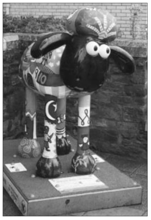
Seventy Shaun the Sheep appeared around Bristol during the summer of 2015.

Over the summer of 2015, Bristol celebrated Shaun the Sheep with over seventy sculptures of Shaun dotted around Bristol, which attracted huge crowds. We aren't expecting quite as many creations,