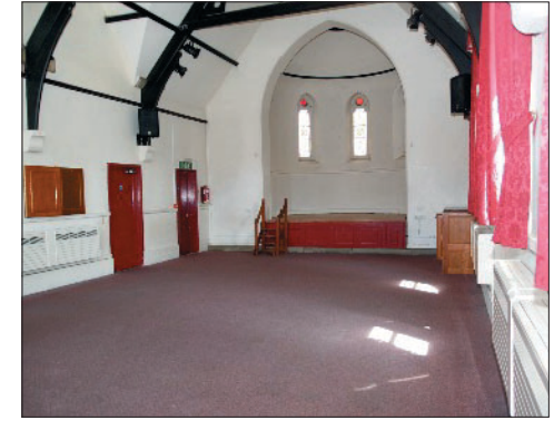
Garth Room 40ft x 22ft