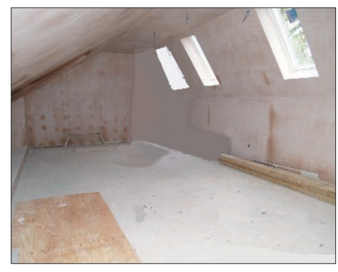
New Meeting Room 37ft x 14 ft