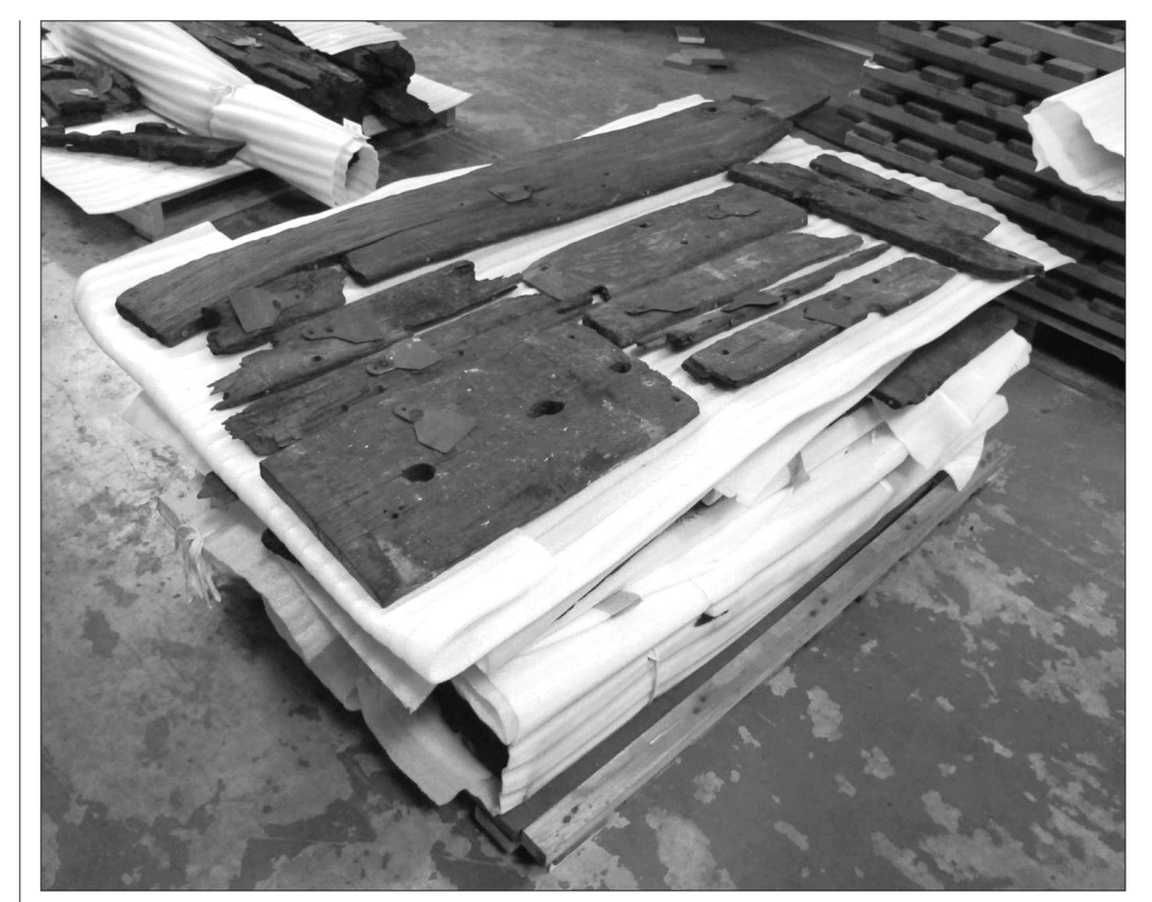
A pallet of preserved timbers, all destined for the climate controlled store that we have created to ensure that these will last another 500 years.

This has advantages and disadvantages. Only in the winter of 2015/16 has the process of drying out the Mary Rose been completed. The Mary Rose Museum is closed until the summer of 2016 while major work is completed. Compare that with the fact that the majority of the pieces of the Newport ship have been cleaned, conserved and freeze dried, a process that will be completed within the next two years. It has also given archaeologists important information as to how ships were built at a time of rapid change in shipbuilding. The downside is that the Newport ship will have to be rebuilt in the new purpose built museum, once that has been agreed.