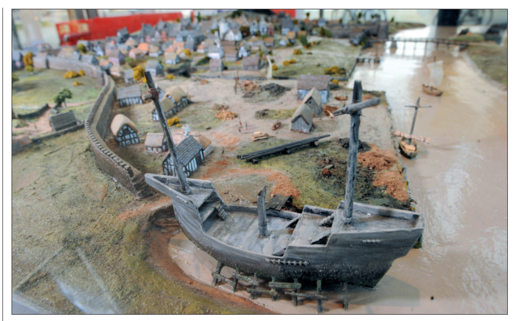
Diorama created to allow visualisation of medieval Newport, with our Ship in its side 'pill' under repair. This is currently in the University of South Wales, Newport Riverside Campus.