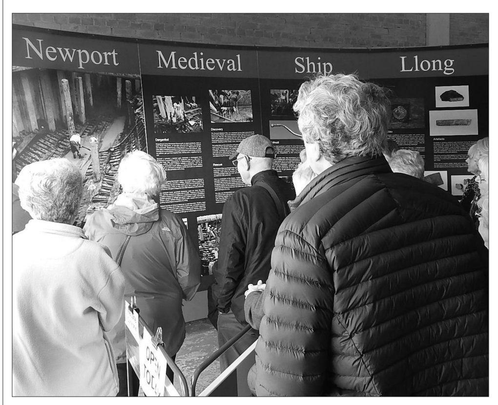
Visitors to the Ship Centre around our entrance display.

Fridays and Saturdays from February 2016, in its warehouse/ship centre at Newport, which gives an excellent understanding of the processes that have been used to conserve the ship and the detective work undertaken to date this priceless find. To check opening times look on the Newport Ship web site