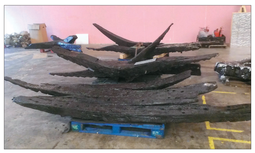
Frames from the ship - some weighing over 1,000kg