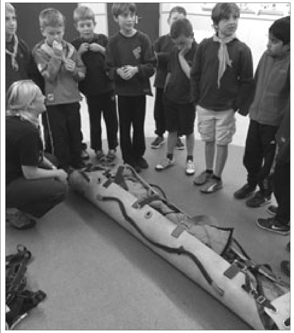
Who is using the stretcher?