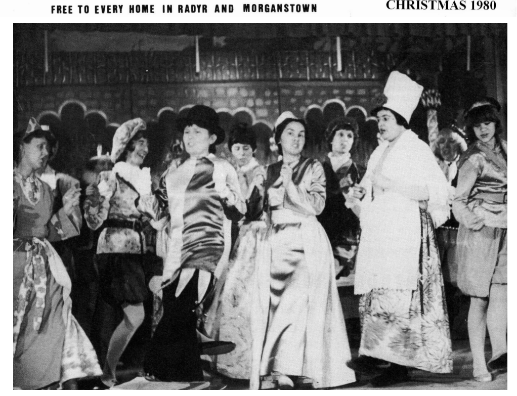
Members of the W.I. and supporting cast showing a leg at the Pantomime Drama rehearsal.