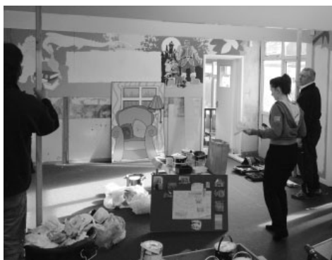
Artists developing our Foundation Phase Area