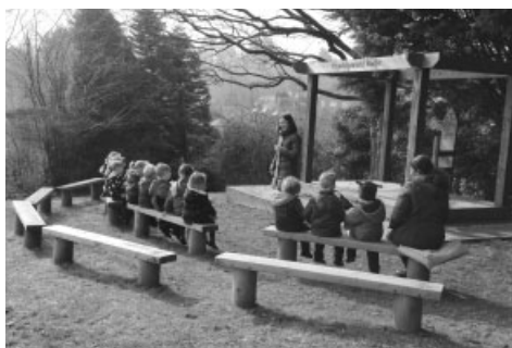
Our nursery children ready to go on a bear hunt around our nature trail