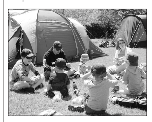
Day 4 - And so the final day, tents all down bags packed parents collecting their little treasures.

There was much excitement when burger and chips were served for tea. Then with a mug of hot chocolate in hand we sang round our last campfire, each cub recounting their best and worst bits of camp.