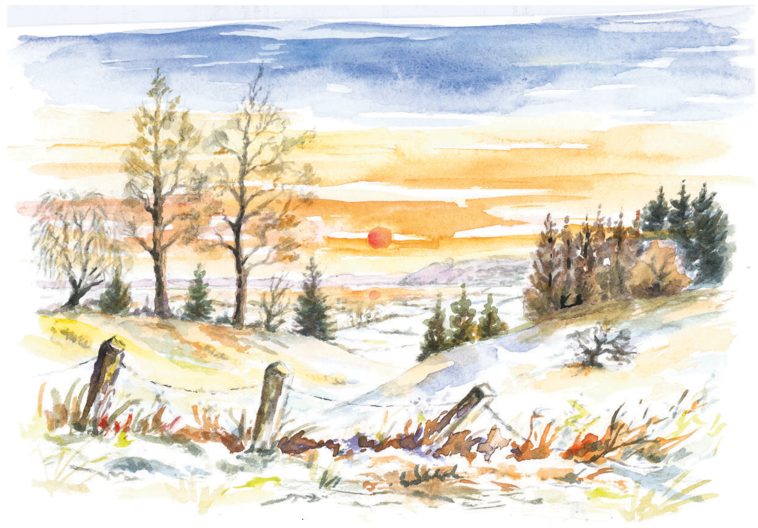
A winter scene by Sylvia Middleton

What a fantastic response once again! We presented our filled Christmas shoe boxes at 11am. Service at Christ Church on Sunday, 18th November and what a glorious, multi-coloured wall we built. Each box was filled to capacity with interesting gifts for boys and girls of specific ages.