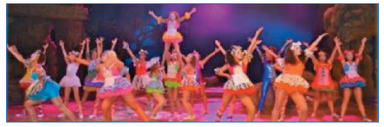
Dance Angels, who rehearse in the Old Church Rooms in Radyr each Wednesday evening, were delighted to be invited to perform at Disney Land Paris in August. This follows their success in the reaching the semi-finals of Britain's Got Talent on ITV. The troupe took 50 dancers to perform in the Disney Parade celebrating 20 years of Disneyland Paris. Dance Angels are also in the process of auditioning for the hit show Sky 1 Got To Dance . to be shown later this year.