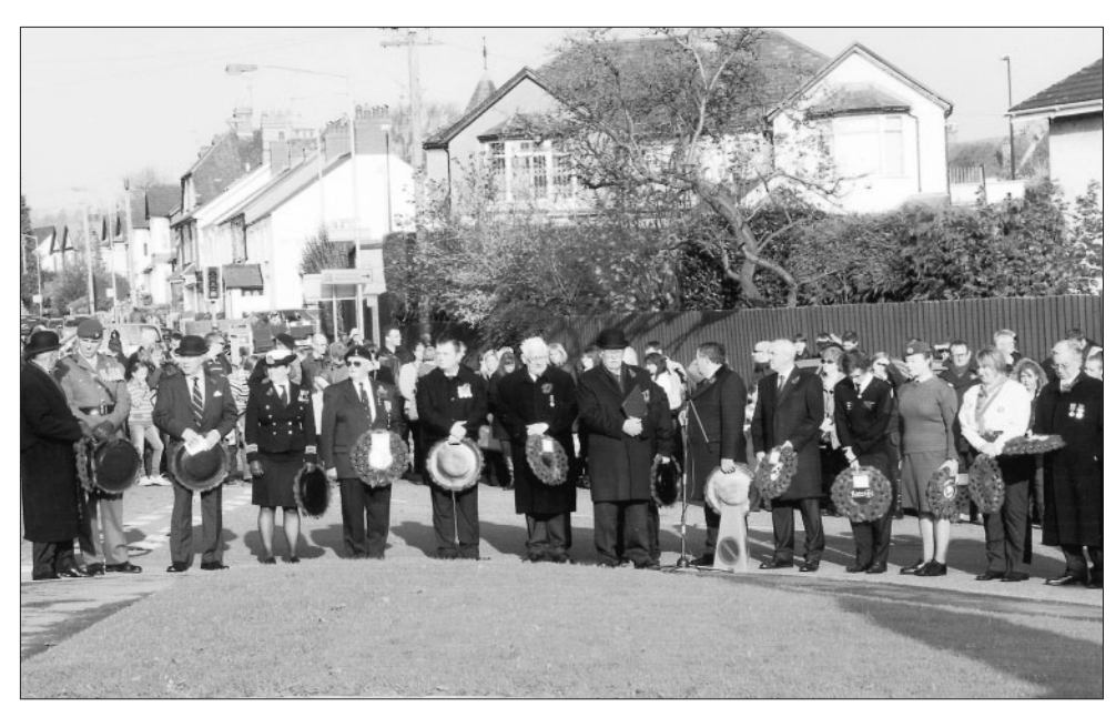
www.radyr.org.uk is...a window on our local history

A minibus has been organised to run between Radyr and Fairwater libraries once a week on a Wednesday morning. The bus will pick up from outside Radyr Library at 10.45am and then leave Fairwater at 12.30pm. Please note that this service is for elderly and disabled borrowers only and places MUST be prebooked by phoning Fairwater Library on 2078 5583.