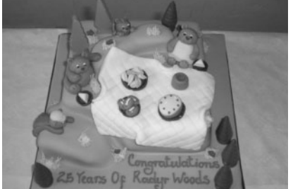
Birthday cake acknowledging the Wardens' many Teddy Bears' Picnics run for local children