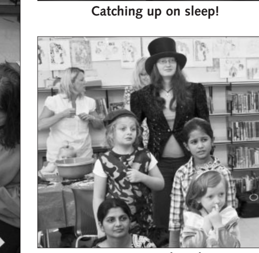
Circus Day at the Library