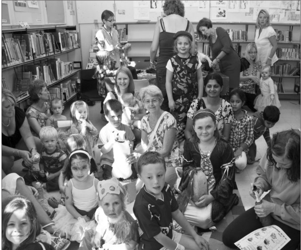
www.radyr.org.uk is...a one-stopshop for local information