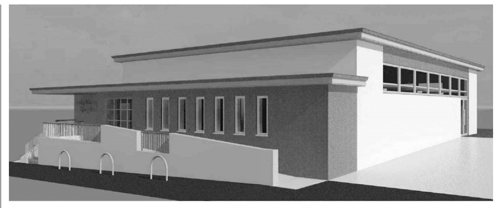
Library 3D view West

PS: since writing this I have seen the article written jointly by R+MCC and R+MA. They point out that this scheme has stalled since 2004 but I was only elected in 2008 and considerable progress has been made since then. I regret that the capital funding provided by Cardiff Council has reduced and I lobbied at all levels for reinstatement; I also pressed Taylor Wimpey in 2008 to agree a change in the wording of the agreement for community land and no other local representatives(including R+MCC and R+MA ) had thought to do this. The wording was clear and it was obvious to