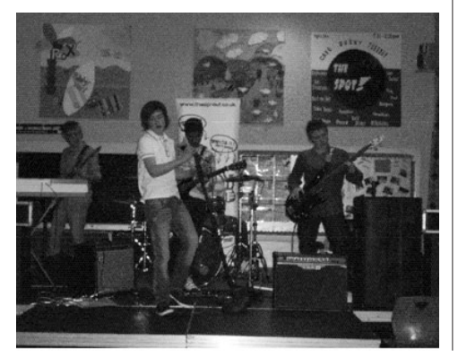
Battle of the Bands winners 'Session One'.

Semi finals were held earlier this year on the 8th March, and the winners for 2010 were a