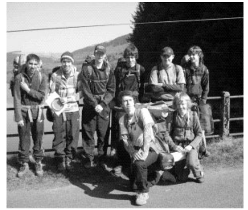
Duke of Edinburgh Bronze qualifying walks