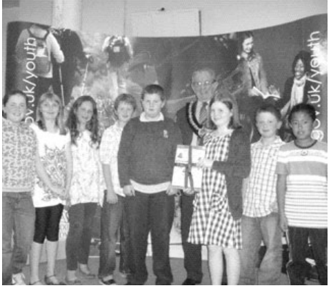
Young Achievers Award Winners

The award winners had to learn new skills in a range of different fields including cookery, sport, arts and crafts and cookery, as