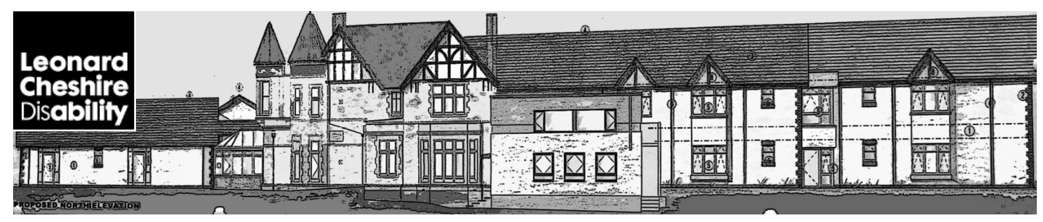
Artist impression of Danybryn and new development