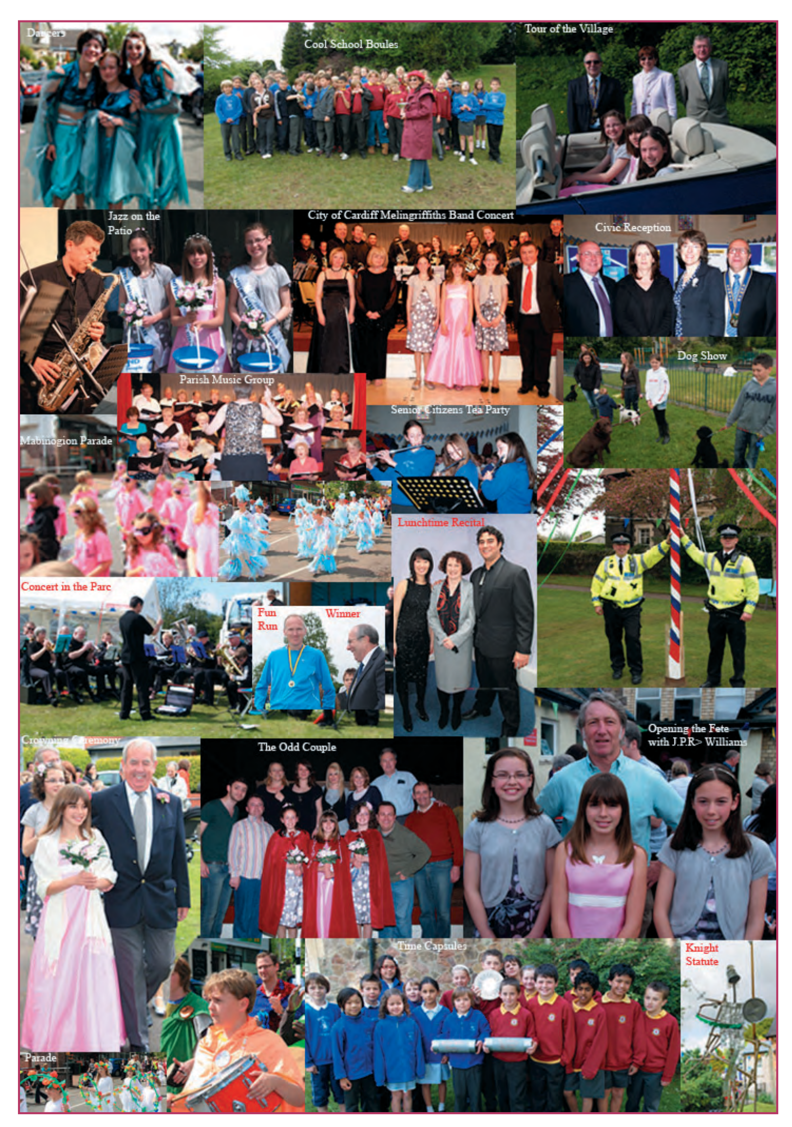
www.morganstown.org.uk \ is...a \ source \ of \ news \ about \ local \ people \ and \ events