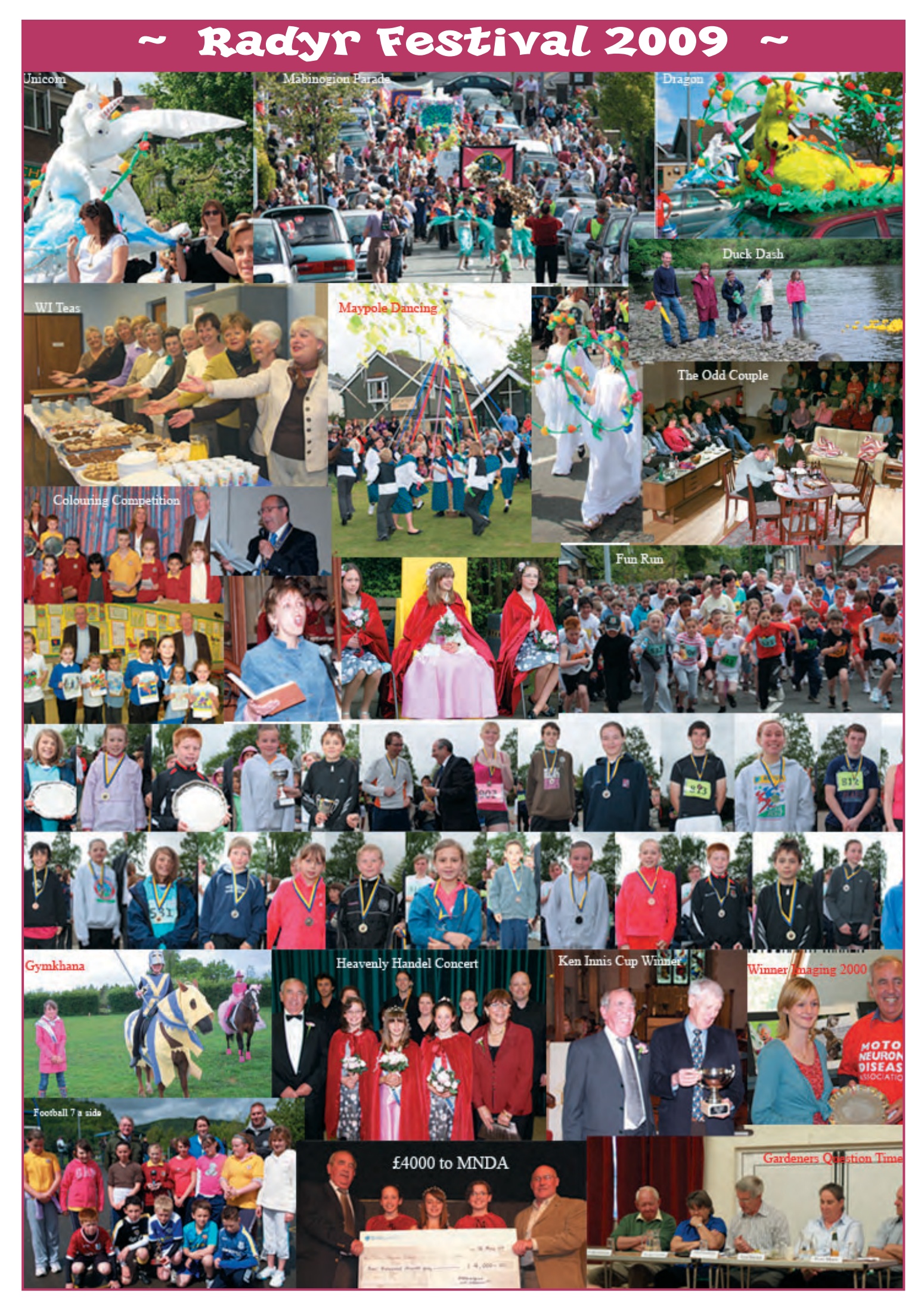
www.radyr.org.uk is...a source of news about local people and events