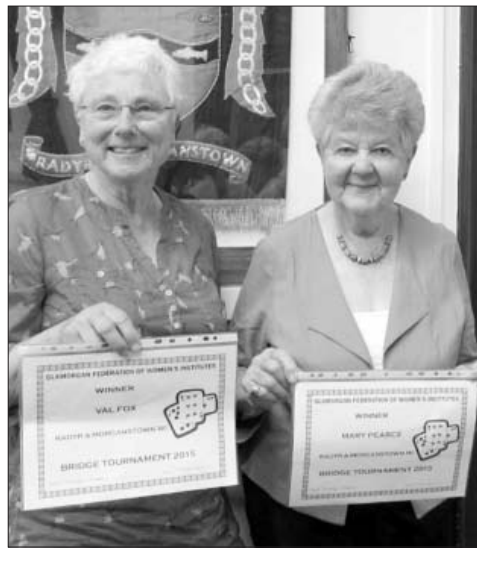
Winners of the WI County Bridge Competition

Meanwhile, have a good summer – let's hope it stops raining! L.J.H.