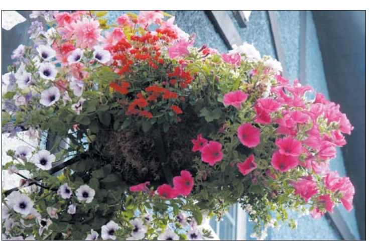
Congratulations to the Community Association and the Community Council for organising and funding fifteen delightful hanging baskets in Station Road. Best yet!.

Cofiwch, os byddwch yn cwblhau eich her darllen, byddwch yn cael medal a thystysgrif yn yr ysgol a thaleb hufen ia gan joe's ice cream