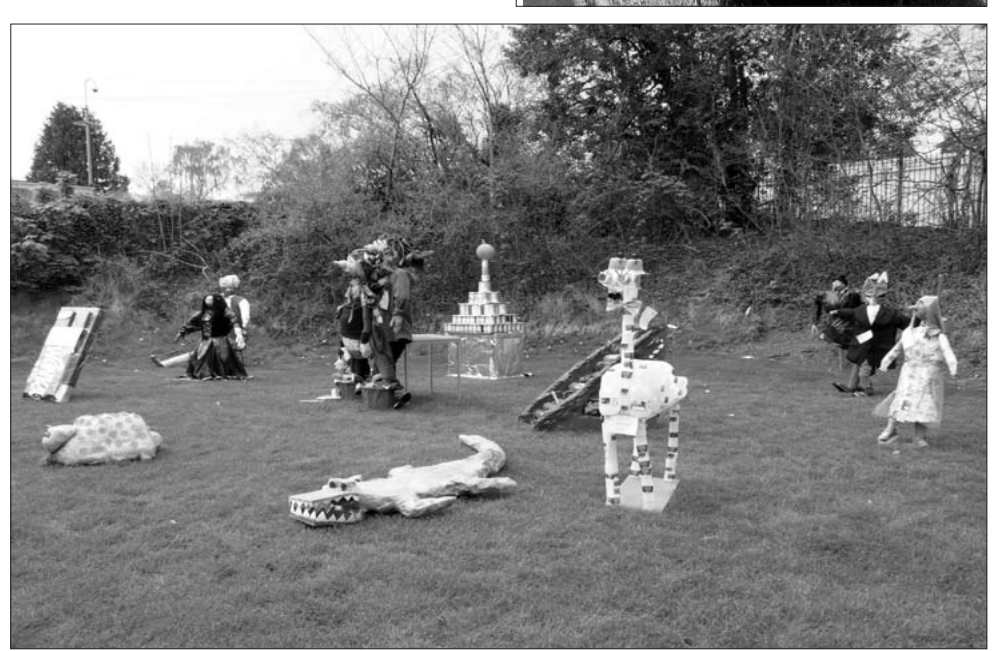
www.radyr.org.uk is...a window on our local history