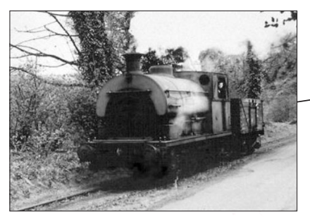
2. Steam train on tramway