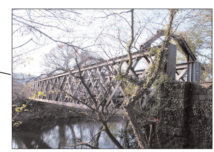
7. Iron Bridge