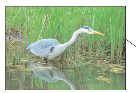
4. Heron at the hide