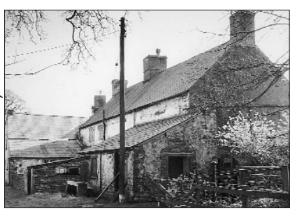
6. Gelynis Farm