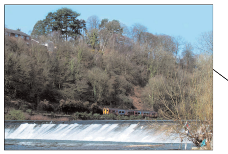
3. Radyr Weir